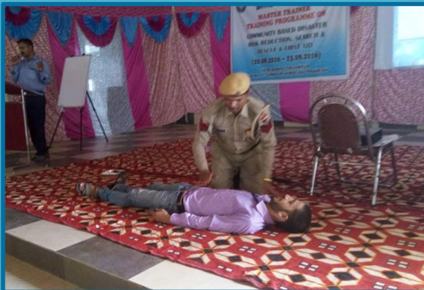
A session on first aid from the training at Nahan, Himachal Pradesh