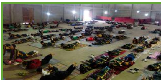
Youth celebrating International Yoga Day inside the school auditorium in South Sikkim

Second International Yoga Day was celebrated with much fervour across the country including all the 29 NYKS district Kendras under project, ‘Strengthening NYKS and NSS’. Over 4000 young people gathered across the 29 districts on 21 June to commemorate and practice yoga. Their enthusiasm was unparalleled, with some districts celebrating the day even under extreme weather conditions. For example, in South Sikkim, over 250 youth gathered for International Yoga Day despite heavy rain and thunderstorms and performed yoga in four different halls of the school instead of the originally planned venue.